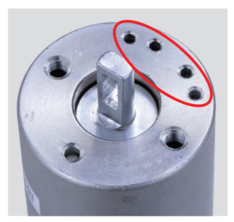
③ # of Mounting Hole