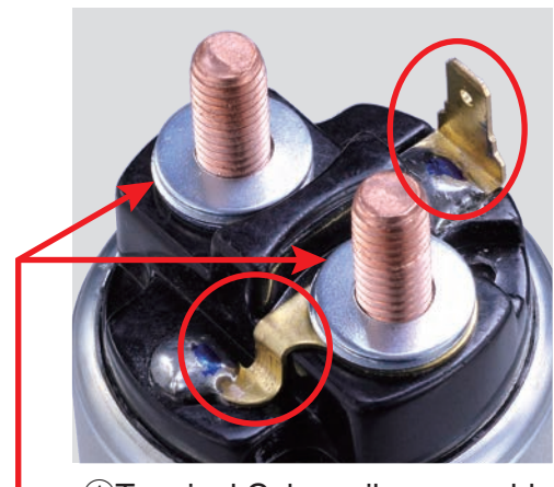
1) Terminal Colour silver \rightarrow gold ②normal nut → "Speed Nut"